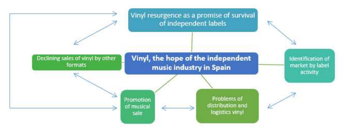
1.2 Related categories by axial codification

Vinyl lovers argue that acetates ensure high fidelity and better sound, they say that to enjoy high quality sound that music can offer, it can be found in everything that vinyl format promises. Of the eight records that were interviewed, they specify certain criteria which ensure that the vinyl keeps independent music business in the market: